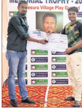
ବିଶ୍ଵଜିତ ଷ୍ଟୋରକୁ ପୁରସ୍କୃତ କରାଯାଇଛି।

ଭୁବନେଶ୍ଵର, ୧୩୧ (କ୍ରୀଡ଼ା ପ୍ରତିନିଧି): କେଶ୍ଵରୀ ଖେଳ ପଡ଼ିଆରେ ଚାଲିଥିବା ପଞ୍ଚାଶନ ବେନା ସ୍ମାରକ କ୍ରିକେଟ ଚୁନାମେଣ୍ଟର ଗୁଜୁରାଟ ଅନୁଷ୍ଠିତ ମ୍ୟାଚରେ ରାମେଶ୍ଵର ଷ୍ଟୋର ୪ ଉତ୍ତମ କିପର ସହିତ ଷ୍ଟୋରକୁ ପରାସ୍ତ କରିଛନ୍ତି। ଟପ୍ ହାରି ପ୍ରଥମେ ବ୍ୟାଟି ଆମନ୍ତ୍ରଣ ପାଇଥିବା ସହିତ ଷ୍ଟୋର ୨୪.୨ ଓଭରରେ ୧୪୬ ରନକରି ଅଲଆଉଟ ହୋଇଥିଲା। କର୍ବାବରେ ରାମେଶ୍ଵର ୨୩.୨ ଓଭରରେ ୪