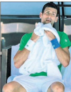
କରାଯାଇଛି। ତ୍ର ଅନୁସାରେ ଆସନ୍ତା ସପ୍ତାହରେ ଓପନିଂ ରାଉଣ୍ଡରେ ଜୋକୋଭିଚ୍ ବିଶ୍ଵର

ମେଲବୋର୍ନ, ୧୩୧ (ଏ.ପି.) ଭିଜା ବିବାଦ ଏପର୍ଯ୍ୟନ୍ତ ଚାଲି ନ ଥିଲେ ମଧ୍ୟ ନୋଭାକ୍ ଜୋକୋଭିଚ୍ ଅଷ୍ଟ୍ରେଲିଆନ ଓପନ ଡ୍ର'ରେ ସ୍ଥାନ ପାଇଛନ୍ତି। ସର୍ବାଧିକ ଟେନିସ୍ ଷ୍ଟାର ସରକାରଙ୍କ ନିଷ୍ପତ୍ତି ଅପେକ୍ଷାରେ ରହିଛନ୍ତି। କୋଭିଡ୍ ଭାଙ୍ଗିନ ନେଇ ନ ଥିବାରୁ ଅଷ୍ଟ୍ରେଲିଆ ସରକାର ଜୋକୋଭିଚ୍ଙ୍କ ଭିଜା ବାଟିଲ କରି ତାଙ୍କର ପ୍ରତ୍ୟର୍ପଣ କରିବାର ବ୍ୟବସ୍ଥା କରିବେ କି ନା ତାହା ଏବେ ସୁଦ୍ଧା ଅସ୍ପଷ୍ଟ ରହିଛି। ଅଷ୍ଟ୍ରେଲିଆନ ଓପନ ଡ୍ର'ରେ କିନ୍ତୁ ତାଙ୍କୁ ଚପ୍ ସିଡ୍ ମାନ୍ୟତା ପ୍ରଦାନ କରାଯାଇଛି। ତ୍ର ଅନୁସାରେ ଆସନ୍ତା ସପ୍ତାହରେ ଓପନିଂ ରାଉଣ୍ଡରେ ଜୋକୋଭିଚ୍ ବିଶ୍ଵର