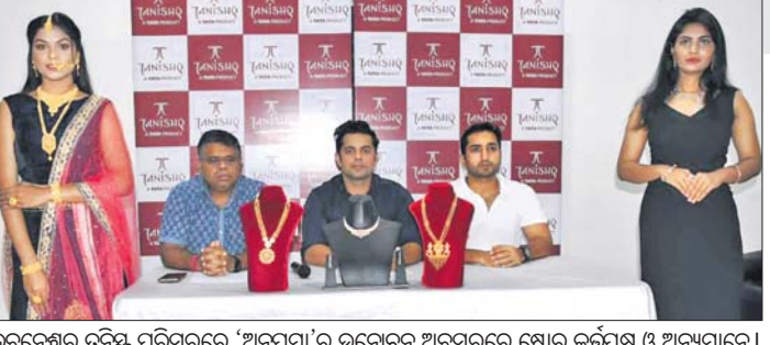
ଭୁବନେଶ୍ୱର ତନିଷ୍କ ପରିସରରେ 'ଅନୁପମ'ର ଉନ୍ନତ ଅବସରରେ ଷ୍ଟୋର କର୍ତ୍ତୃପକ୍ଷ ଓ ଅନ୍ୟମାନେ।

କଳିଙ୍ଗ ବର୍ଷର ଅକ୍ଷୟ ତୃତୀୟା ଉପଲକ୍ଷେ ଚାଟା ରୁଦ୍ର ଅକ୍ଷୟ ଟ୍ରାଷ୍ଟ 'ତନିଷ୍କ' ପକ୍ଷରୁ ଆକର୍ଷଣୀୟ ଅପର ଓ ମନଲୋଭା ତିକାଜନର ସମ୍ପର୍କ ସହ 'ଅନୁପମ' ନାମରେ ନୂତନ ଉତ୍ପାଦନ ଉନ୍ନତ କରାଯାଇଛି।