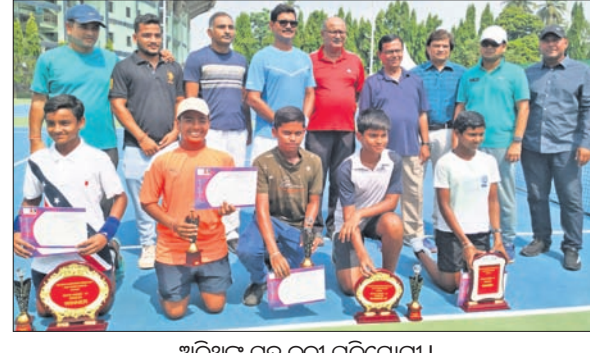
ଅତିଥିକ ସହ କୁଟା ପ୍ରତିଯୋଗୀ।