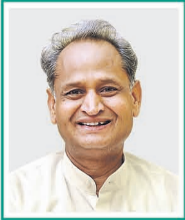
ASHOK GEHLOT Chief Minister, Rajasthan