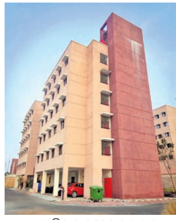
ମେଡିକାଲ କଲେଜ ଛାତ୍ରାବାସ