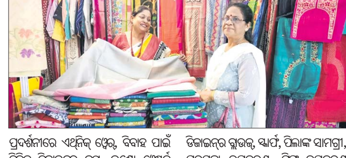
ପ୍ରଦର୍ଶନୀରେ ଏଥିକ୍ ଫ୍ରେଜ୍, ବିବାହ ପାଇଁ ବିଭିନ୍ନ ଡିଜାଇନର ବସ୍ତୁ, ଲୁଗା-ଫ୍ରେସ୍ ବର୍ଗ, ଗାଉଡ଼, ହାଣ୍ଡଲୁମ୍ ଶାଢ଼ି, ପାରମ୍ପରିକ ଭଳି ବିଭିନ୍ନ ପ୍ରକାର ଜିନିଷ ଉପଲବ୍ଧ।

ଭୁବନେଶ୍ୱର, ୨୨୧୪: ଗୋଟିଏ ଛାତ୍ର ତଳ ଓଡ଼ିଶାବାସୀଙ୍କୁ ବିଭିନ୍ନ ବର୍ଗର ବସ୍ତୁକୁ ଉପହାର ପର୍ଯ୍ୟନ୍ତ ସାମଗ୍ରୀ ଯୋଗାଇଦେବାର ଲକ୍ଷ୍ୟ ନେଇ ଭିନ୍ନ-ଭିନ୍ନ ପକ୍ଷରୁ ସ୍ଥାନୀୟ ମାଷ୍ଟର କ୍ୟାଣ୍ଟିନ ନିକଟସ୍ଥ ପ୍ରେସ୍ କ୍ଲବ୍ ପରିସରରେ ଭିନ୍ନ-ଭିନ୍ନ ଫେୟାର ଶୁକ୍ରବାର ଶୁଭାରମ୍ଭ ହୋଇପାରିଛି।