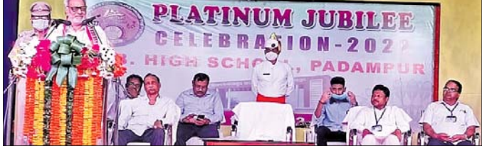
ପୁରୁଷମାନଙ୍କୁ ଦୃଷ୍ଟିକୋଣରେ ପ୍ରଦର୍ଶିତ କରିଥିଲେ ରାଜ୍ୟପାଳ ଗଣେଶ ଲାଲ ବରଗଡ଼ ଜିଲ୍ଲା ପଞ୍ଚମୁର ରାଜବୋତାସର ହାଇସ୍କୁଲର ପୁରୁଷମାନଙ୍କୁ ଦୃଷ୍ଟିକୋଣରେ ପ୍ରଦର୍ଶିତ କରିଥିଲେ। ସମସ୍ତେ କିଛି ଭାବରେ ଅଭିଯୁକ୍ତ ବୈଦୁକ୍ତି। ପୁରୁଷମାନଙ୍କୁ ଅପହରଣ ସମୟରେ ଅଭିଭାବକଙ୍କୁ କୃତଜ୍ଞତା ଜ୍ଞାପନ କରୁଛି ବୋଲି ଓଡ଼ିଶାର ରାଜ୍ୟପାଳ ପ୍ରଫେସର ଗଣେଶ ଲାଲ ବରଗଡ଼ ଜିଲ୍ଲା ପଞ୍ଚମୁର ରାଜବୋତାସର ହାଇସ୍କୁଲର ପୁରୁଷମାନଙ୍କୁ ଦୃଷ୍ଟିକୋଣରେ ପ୍ରଦର୍ଶିତ କରିଥିଲେ।