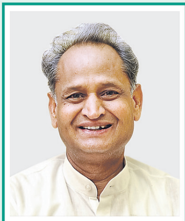
ASHOK GEHLOT Chief Minister, Rajasthan