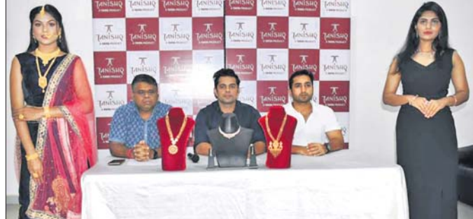
ଭୁବନେଶ୍ୱର ତନିଷ୍କ ପରିସରରେ 'ଅନୁପମା'ର ଉନ୍ନତନ ଅବସରରେ ଷ୍ଟୋର କର୍ତ୍ତୃପକ୍ଷ ଓ ଅନ୍ୟମାନେ।

ଭୁବନେଶ୍ୱର, ୨୨୧୪ ଚଳିତ ବର୍ଷର ଅକ୍ଷୟ ତୃତୀୟା ଉପଲକ୍ଷେ ଗଣା ଗୁଡ଼ିଏ ଅକଳ୍ପୀତ କ୍ରୀଡ଼ା 'ତନିଷ୍କ' ପକ୍ଷରୁ ଆକର୍ଷଣୀୟ ଅଫର ଓ ମନଲୋଭା ଡିଜାଇନର ସମ୍ପର୍କ ସହ 'ଅନୁପମା' ନାମରେ ନୂତନ ଉତ୍ପାଦନ ଉନ୍ନତନ କରାଯାଇଛି।