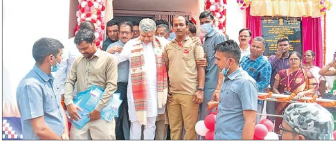
ମାଲକାନଗିରିରେ ରେଳମନ୍ତ୍ରୀ ଅଶ୍ୱିନୀ ଦେବଶ୍ୟାମ୍ବର ମୁଖ୍ୟ ଡାକଘର କୋଠା ଉଦ୍ଘାଟନ କରୁଛନ୍ତି।

ରେଳ, ଯୋଗାଯୋଗ ଓ ଇଲେକ୍ଟ୍ରିକାଲିଟି, ସୂଚନା ଓ ପ୍ରଯୁକ୍ତିବିଦ୍ୟା ମନ୍ତ୍ରୀ ଅଶ୍ୱିନୀ ଦେବଶ୍ୟାମ୍ବର ନେତୃତ୍ୱରେ କୋରାପୁଟ-ମାଲକାନଗିରି ଜିଲ୍ଲା ଗସ୍ତକରି ବିଭିନ୍ନ କାର୍ଯ୍ୟକ୍ରମର ସମୀକ୍ଷା କରିଛନ୍ତି।