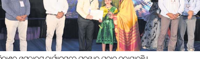
ବିକାଶର ସ୍ୱଚ୍ଛତା-୨୦୨୨ ଉଦ୍‌ଯାପିତ ପ୍ରଦାନ କରାଯାଇଛି।