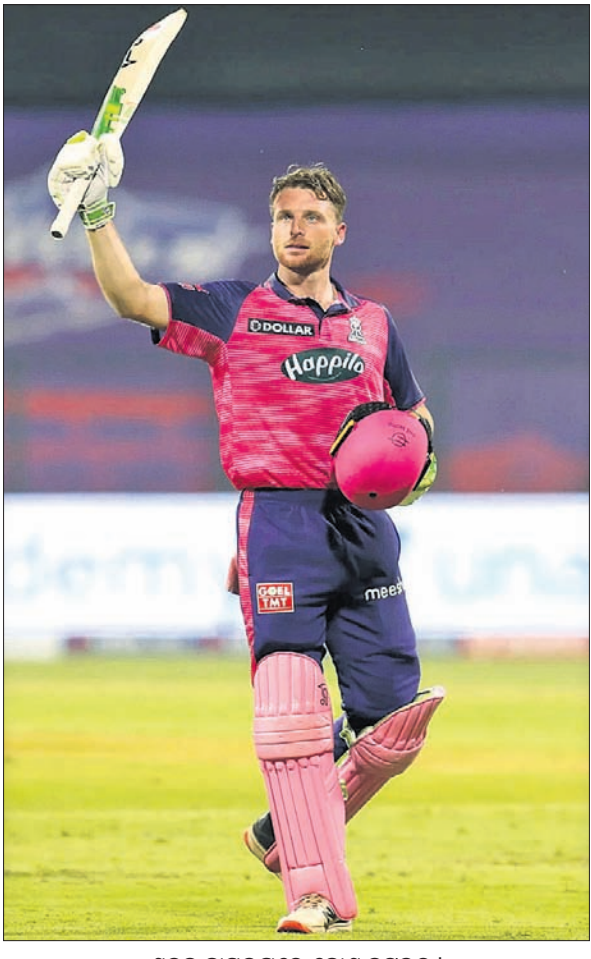
ଶତକ ହାସଲପରେ କୋଶ୍ ବଟଲର।

କରିଥିଲେ। ଚଳିତ ଆଇପିଏଲ୍‌ରେ ଏହାପରି ଚାକର ତୃତୀୟ ଶତକ। ଅଧିନାୟକ ସଞ୍ଜୁ ସାମନ୍ତ ଖେଳିଥିଲେ ଷ୍ଟ୍ରିକ୍‌ପୁର୍ସ୍ ଇନିଂସ। ସେ ମାତ୍ର ୧୯ ବଲ୍‌ରୁ ୫ ଟୋକା ଓ ୩ ଛକା ସହାୟତାରେ ୪୬ ରନରେ