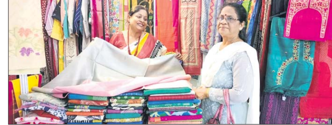
ପ୍ରଦର୍ଶନୀରେ ଏଥିକ୍ ଫ୍ରେଜ୍, ବିବାହ ପାଇଁ ପଡ଼ିଆ ଭିନ୍ନ ଭିନ୍ନ ଫେୟାର ଉଭୟ ବ୍ୟବସାୟୀ ଏବଂ ଗ୍ରାହକଙ୍କ ମଧ୍ୟରେ ସମ୍ପର୍କ ସୃଷ୍ଟି କରିବାର ଏକ ମାଧ୍ୟମ ପାଲଟିବ ବୋଲି ସମ୍ପାଦକ ପକ୍ଷରୁ କୁହାଯାଇଛି।