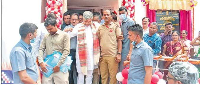
ମାଲକାନଗିରିରେ ରେଳମନ୍ତ୍ରୀ ଅଶ୍ୱିନୀ ଦେବଶ୍ୱର ମୁଖ୍ୟ ଡାକଘର କୋଠା ଉଦ୍ଘାଟନ କରୁଛନ୍ତି।

ରେଳ, ଯୋଗାଯୋଗ ଓ ଇଲେକ୍ଟ୍ରିକାଲିଟି, ସୂଚନା ଓ ପ୍ରଯୁକ୍ତିବିଦ୍ୟା ମନ୍ତ୍ରୀ ଅଶ୍ୱିନୀ ଦେବଶ୍ୱର ଶୁକ୍ରବାର ଦିନିକିଆ କୋରାପୁଟ-ମାଲକାନଗିରି ଜିଲ୍ଲା ଗସ୍ତକରି ବିଭିନ୍ନ କାର୍ଯ୍ୟକ୍ରମର ସମୀକ୍ଷା କରିଛନ୍ତି।