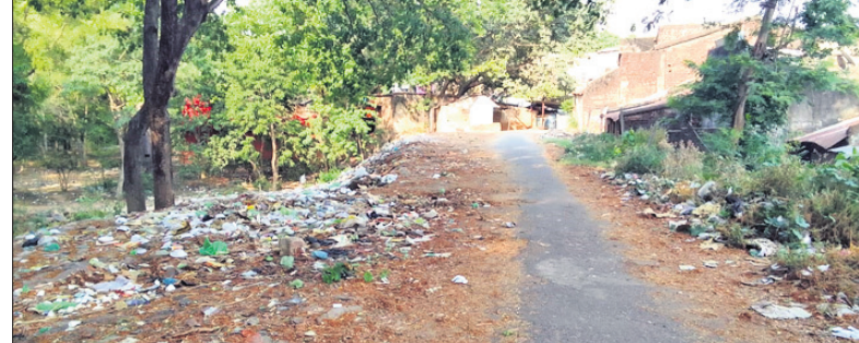
ମାଳବନ୍ଧ ରାସ୍ତାରେ ଆବର୍ଜନା ପଡ଼ିରହିଛି ।

କଷିଲୋ ଶ୍ରମୀକମାନଙ୍କ ପାଠକୁ ପ୍ରତିଦିନ ଶତାଧିକ ପର୍ଯ୍ୟନ୍ତ ଆଦିଆନ୍ତି । କଷିଲୋ ବଜାର ଛକଠାରୁ ନାଳମାଧବ ନଦୀ ପର୍ଯ୍ୟନ୍ତ ପାର୍ଶ୍ୱର ବୁଡ଼ି ଯାଇଛି ।