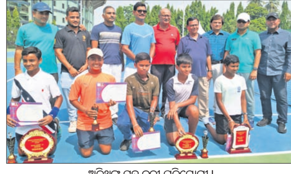
ଅତିଥିକ ସହ କୃତା ପ୍ରତିଯୋଗୀ।