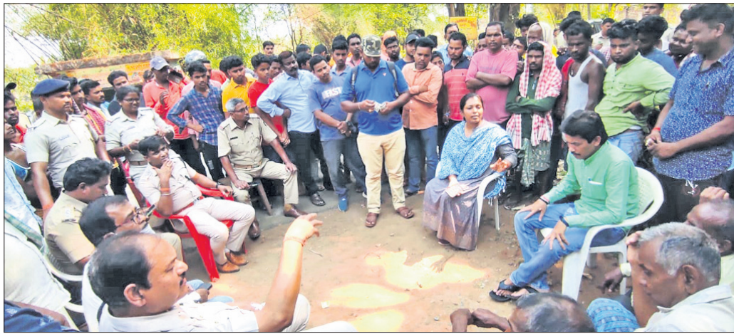
ରାସ୍ତା ଅବରୋଧକାରୀଙ୍କୁ ଓଡ଼ିଶା ଡିଭିଜନର ବିକସିତା ସାମାଜିକ-ସ୍ୱାସ୍ଥ୍ୟ ବିଭାଗର କର୍ମଚାରୀଙ୍କୁ ଦେଖାଯାଇଛି ।