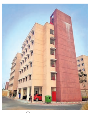
ମେଡିକାଲ କଲେଜ ଛାତ୍ରାବାସ