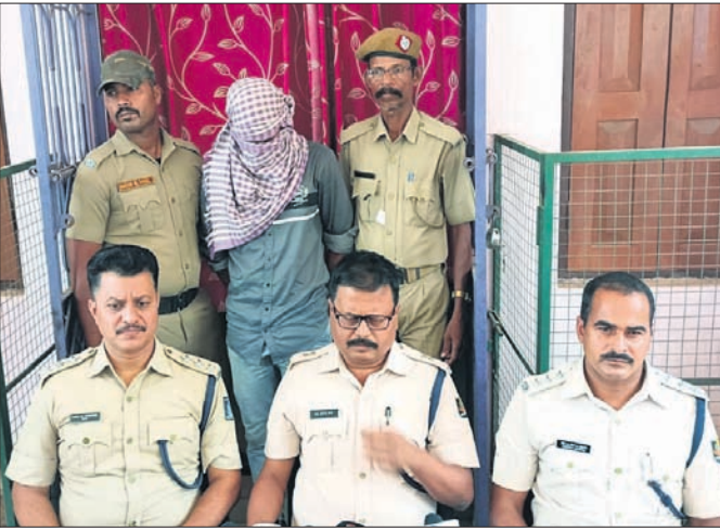
ଶବରଦାତା ସମ୍ମିଳନୀରେ ଅଭିଯୁକ୍ତ ସମ୍ପର୍କରେ ସୂଚନା ଦିଆଯାଇଛି।

ଯାଜପୁର ଜିଲ୍ଲା ବନା ରାମଚନ୍ଦ୍ରପୁର ଥାନା ଅଧୀନ ଅନାୟାସଗ୍ରାମର ବହୁତକିଡ଼ି ନାବାଳିକା ହତ୍ୟା ମାମଲାରେ ଅଭିଯୁକ୍ତଙ୍କୁ ଗିରଫ କରାଯାଇଛି।