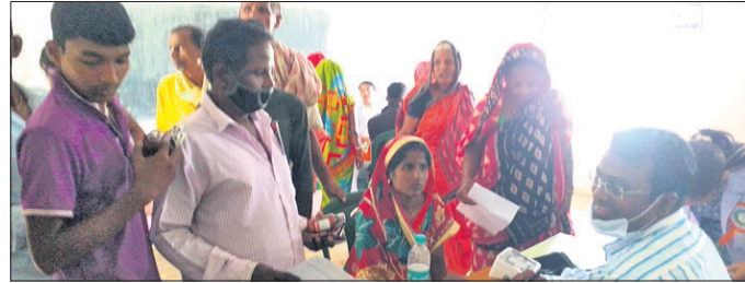
ରୋଗୀଙ୍କ ସ୍ୱାସ୍ଥ୍ୟ ପରୀକ୍ଷା କରାଯାଇଛି।