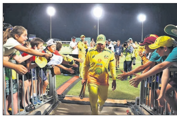
କ୍ୟାରିୟରର ଅତିମ ଅନ୍ତର୍ଜାତୀୟ ଦିନକିଆ କ୍ରିକେଟ ମ୍ୟାଚ ଖେଳି ସାରିବାପରେ ପଡ଼ିଆ ଛାଡ଼ୁଛନ୍ତି ଅଷ୍ଟ୍ରେଲୀୟ ବ୍ୟାଟ୍ସମ୍ୟାନ ଆରୋନ ଫିଣ୍ଡ୍‌ଲି।