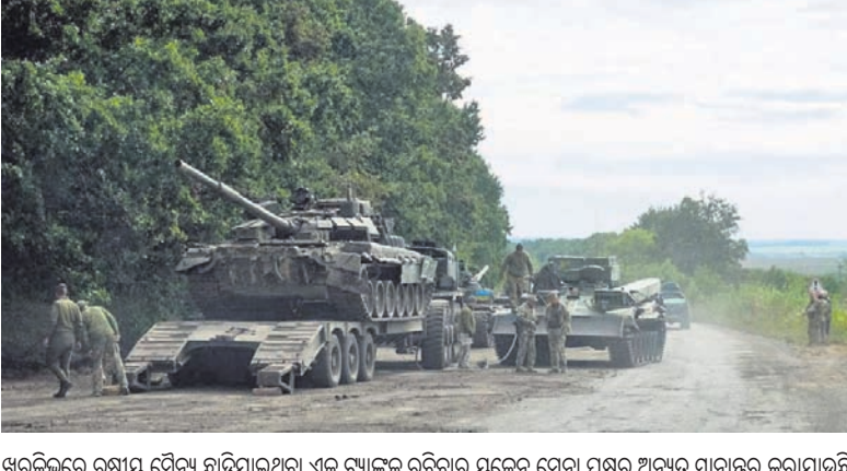
ଖରବିକ୍ରେ ରୁଷୀୟ ସୈନ୍ୟ ଛାଡିଯାଇଥିବା ଏକ ଟ୍ୟାଙ୍କରୁ ରବିବାର ୟୁକ୍ରେନ୍ ସେନା ପକ୍ଷରୁ ଅନ୍ୟତ୍ର ଗୁମାସ୍ତା କରାଯାଇଛି।

କିଲ୍/ମହୋ, ୧୧/୯ ରୁଷିଆ ପ୍ରତିପକ୍ଷକୁ ପୁହୁଡ଼େଇବା ଲାଗି ବେଳ ଦେଇ ୟୁକ୍ରେନ୍ରେ ରୁଷିଆର ଆକ୍ରମଣକୁ ରବିବାର ୨୦୦ ଦିନ ପୂରିଛି। ୟୁକ୍ରେନୀୟ ସୈନ୍ୟମାନେ ଅଞ୍ଚଳକୁ ପୁନଃ ଦଖଲ କରିଛନ୍ତି। ଫଳରେ ରୁଷୀୟ