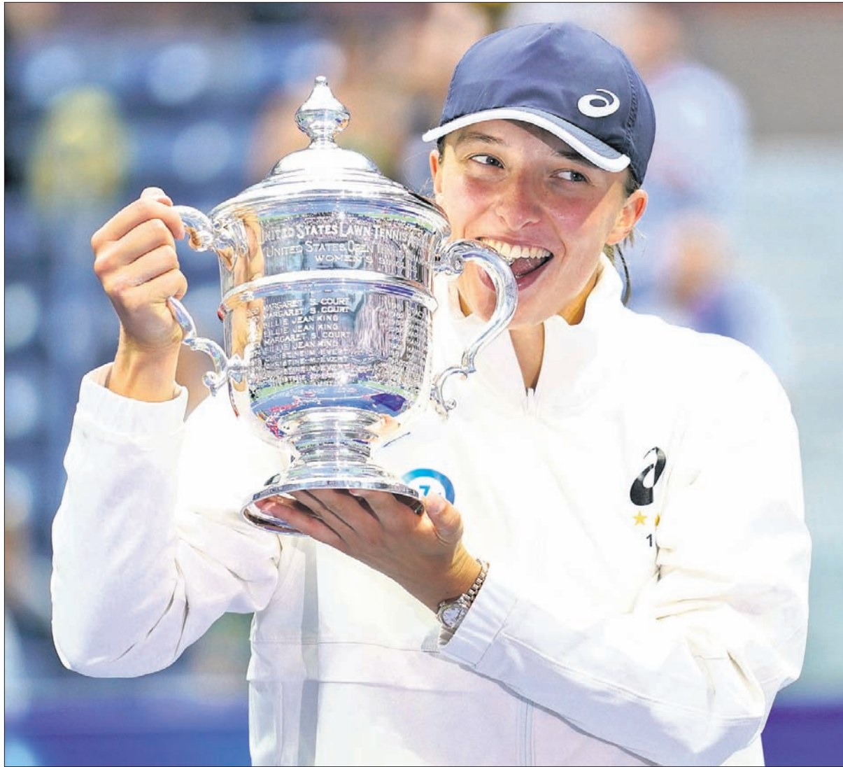
ୟୁଏସ୍ ଓପନ ଗ୍ରାଣ୍ଡସ୍ଲାମ ଚେନିସ ମହିଳା ସିଙ୍ଗଲ୍ ଚାମ୍ପିୟନ ପୋଲିନା ଇଗା ସ୍ୱିଟେକ୍ସ୍ ଟ୍ରଫି ସହ।

ଇଗା ସ୍ୱିଟେକ୍ସ୍ କିଛି ଯୁବକ ଓପନ ମହିଳା ସିଙ୍ଗଲ୍ ଚାଲଚଳ। ବୁଧବିକ୍ରମ ଓଡ଼ିଶାରେ ପ୍ରଥମ କରି ନିଜ କ୍ୟାରିୟରର ବୃତ୍ତାନ୍ତ ଗ୍ରାଣ୍ଡସ୍ଲାମ ହାସଲ କରିଛନ୍ତି। ପୂର୍ବରୁ ବୁଧବିକ୍ରମ ଓଡ଼ିଶା ଗ୍ୟାଲରୀ (ଫ୍ରେଣ୍ଡ ଓପନ) ଜିତି ସାରିଥିବା ସ୍ୱିଟେକ୍ସ୍ ଶନିବାର ରାତିରେ ପ୍ରଥମ ଥର ପାଇଁ ଯୁବକ ଓପନ ବିଜୟୀ ହେବାରେ ସମର୍ଥ ହୋଇଛନ୍ତି। ଏହା ପୂର୍ବରୁ ଯୁବକ ଓପନର ୪ର୍ଥ ରାଉଣ୍ଡ ଅତିକ୍ରମ କରିଥିବା ସ୍ୱିଟେକ୍ସ୍ ପ୍ରଥମ ଥର ପାଇଁ ଫାଇନାଲକୁ ଉଠାଣ୍ଟ ହୋଇଥିବା ବେଳେ ଜିତିହାସ