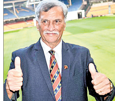
ରୋଜର ବିନି ଓ ବିରାଟ କୋହଲିଙ୍କ ସମେତ ଅନ୍ୟ କେତେଜଣଙ୍କ ବିରୋଧରେ ଏହିଭଳି ଅଭିଯୋଗମାନ ଆଣିଥିଲେ।