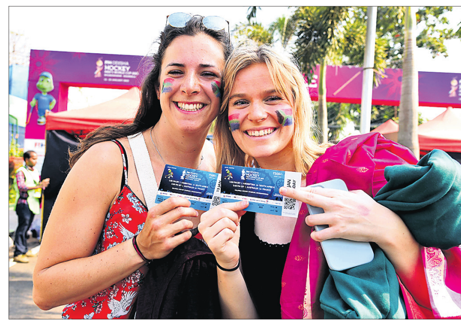
ଦକ୍ଷିଣ ଆଫ୍ରିକାର ଦୁଇ ମହିଳା ପ୍ରଶଂସକ।