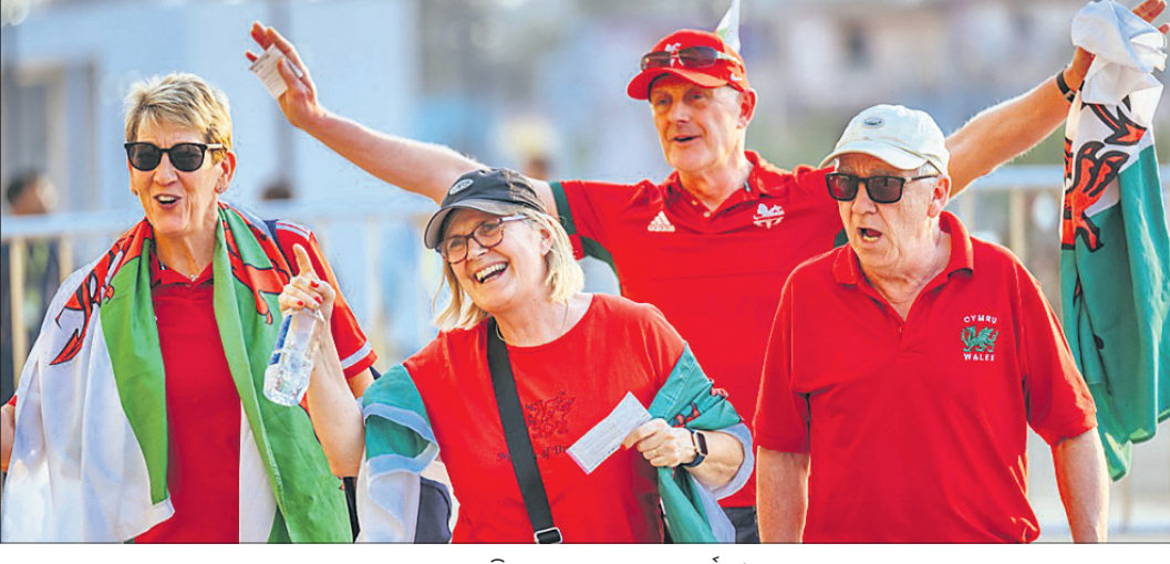
ଭାରତ ବିପକ୍ଷ ମ୍ୟାଚ୍‌ରେ ସ୍ୱେନ୍ ଦର୍ଶକ ।