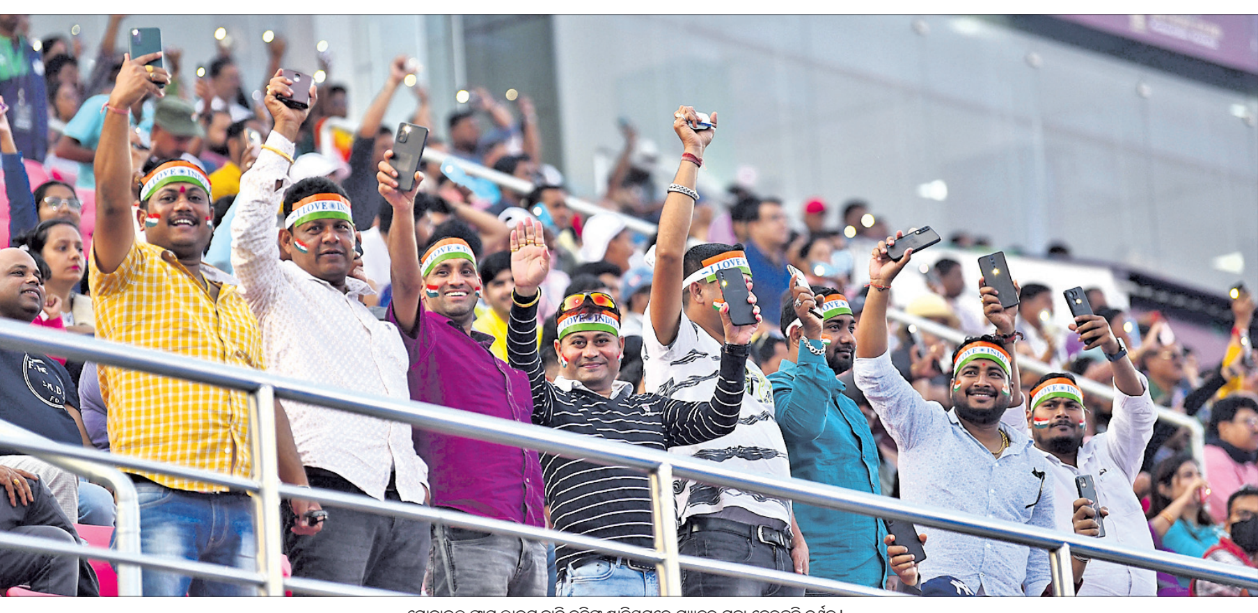
ମୋବାଇଲ୍ ଫୁଲ୍ ଲାଇଭ୍ କାଳି କଳିଙ୍ଗ ଷ୍ଟାଡ଼ିୟମରେ ମ୍ୟାଚର ମଜା ନେଉଛନ୍ତି ଦର୍ଶକ।