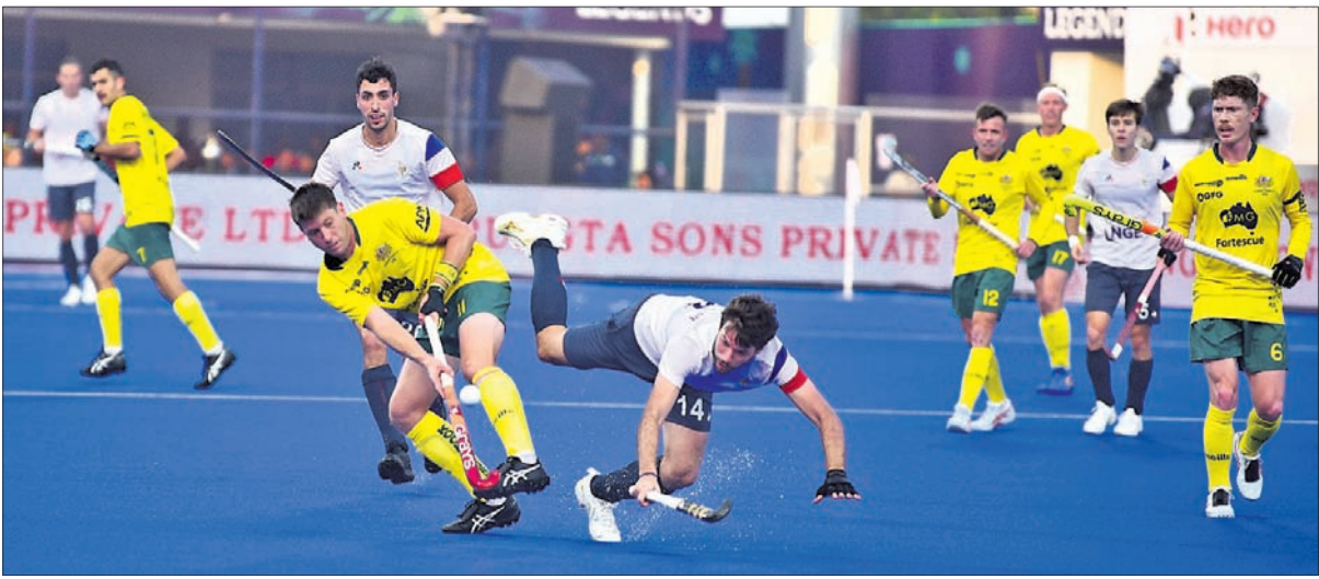
ଅଷ୍ଟ୍ରେଲିଆ-ପ୍ରାୟ ମ୍ୟାଚର ଏକ ସଂଘର୍ଷପୂର୍ଣ୍ଣ ମୁହୂର୍ତ୍ତ।