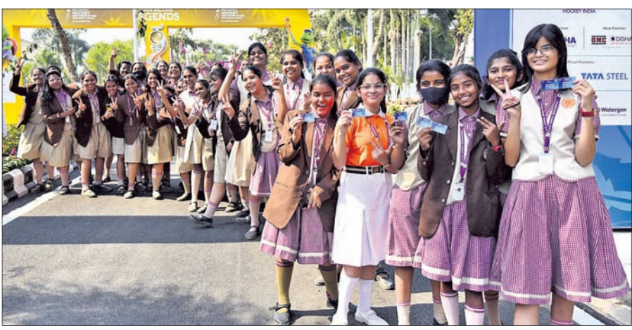
ମ୍ୟାଚ ଦେଖିବାକୁ ଆସିଥିବା ଉତ୍ସାହିତ ସ୍କୁଲ ଛାତ୍ରୀ।