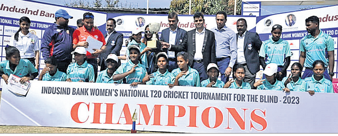
ଅତିଥିକ ସହ ଜାତୀୟ ଦୃଷ୍ଟିବାଧିତ ମହିଳା କ୍ରିକେଟ ଚାମ୍ପିୟନ୍ ଓଡ଼ିଶା ଦଳ।