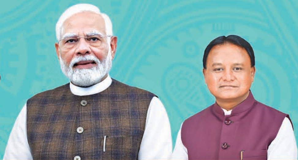
Shri Narendra Modi Prime Minister

Step into the spotlight at the Utkarsh Odisha - Make in Odisha Conclave 2025 , where Odisha's heritage, innovation, and industries coalesce to create an unforgettable legacy of growth. Be part of the visionary process that is transforming the state's industrial kaleidoscope with industry, new-age work culture and a double engine economic boom.